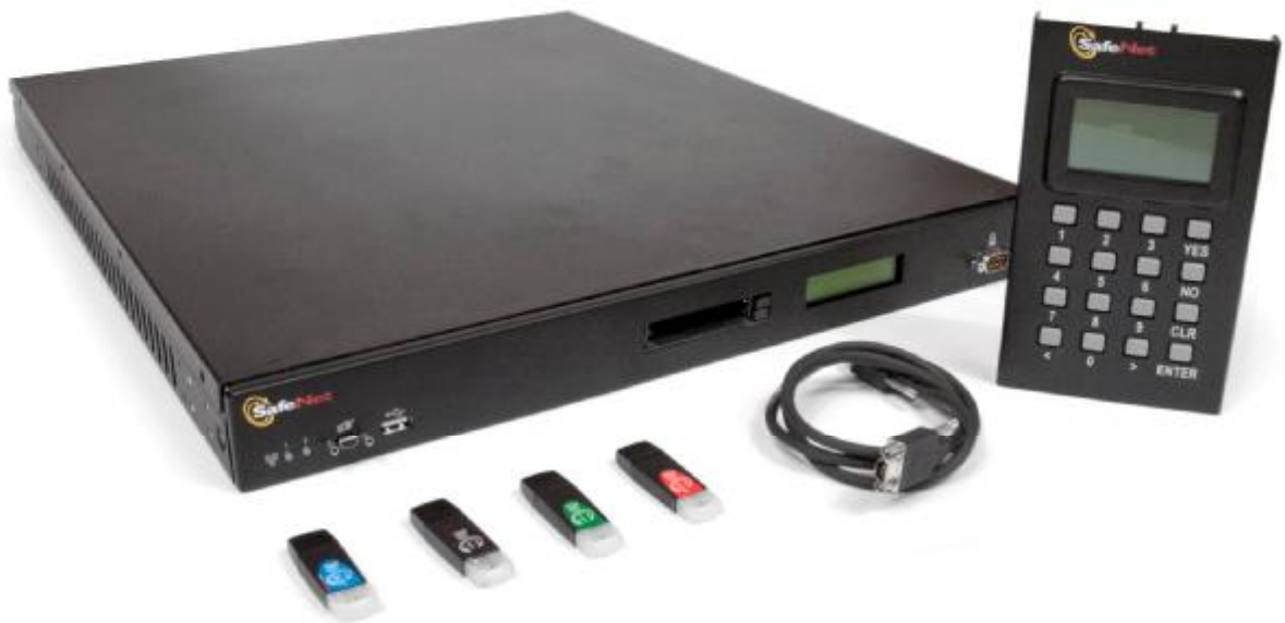
Figure 2 Luna SA with PED and iKeys