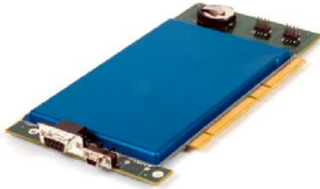
Figure 1. Luna PCI Cryptographic Module

Figure 1 shows the TOE and Figure 2 its appliance deployment configuration – as part of the Luna® SA network-attached appliance.